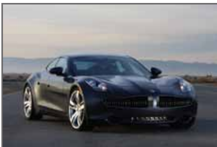
PHEV and EV Passenger Vehicles