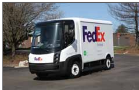
PHEV and EV Commercial Vehicles